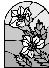
Dryas octopetala L.

The Gathering is coming! Watch for information on registration and theme soon.